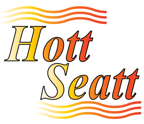
Double the Heatt ... for your Seatt