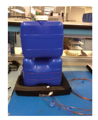
SMP used 80 lb water jugs (heated to 98.6 degrees Fahrenheit) to simulate a human body during the Hott Seatt testing process.

SMP is a third-party technology company that measured the temperature and battery life of the Hott Seatt.